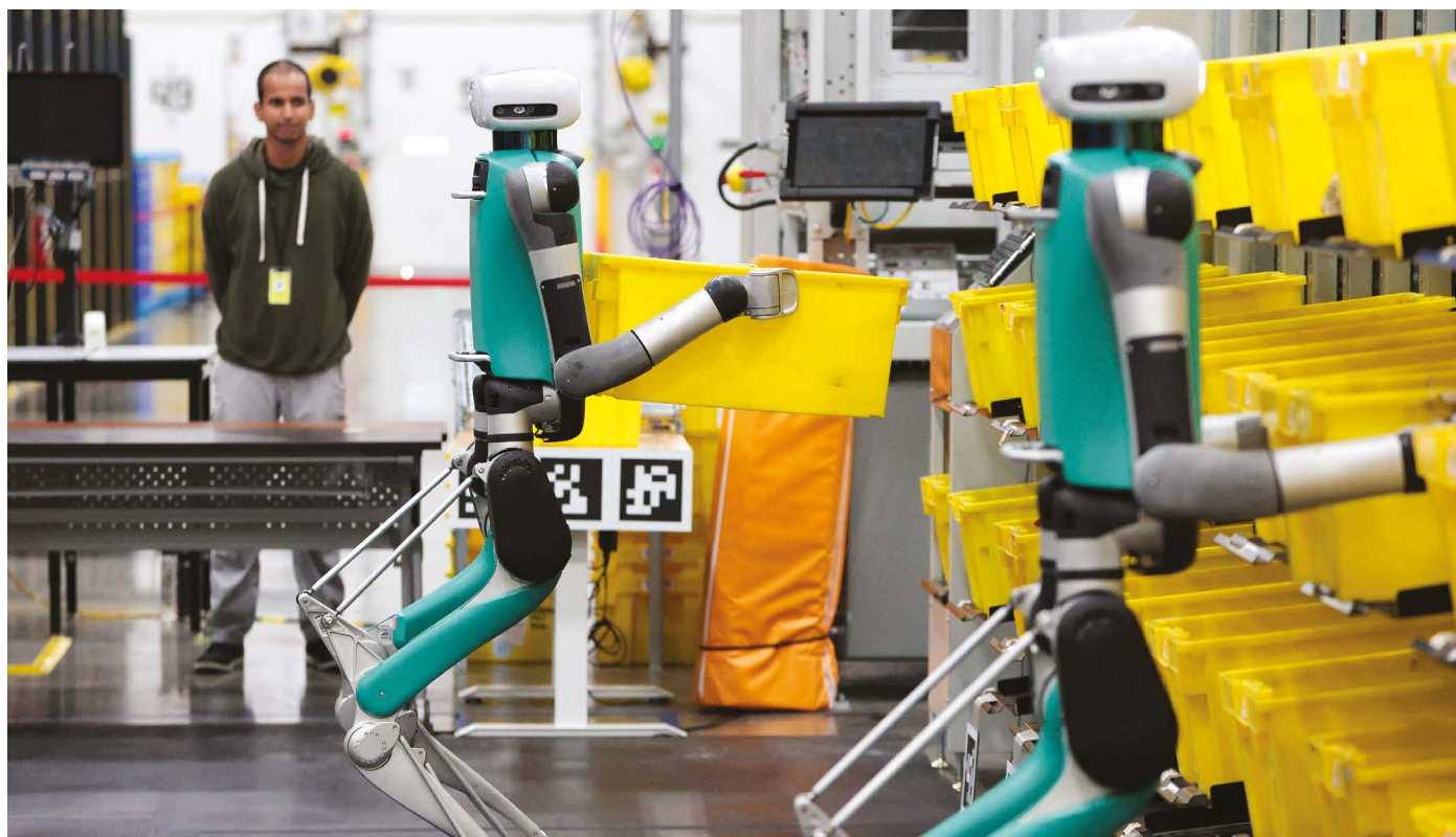
Bipedal robots at Amazon's Robotics Research and Development Hub in Sumner, Washington.